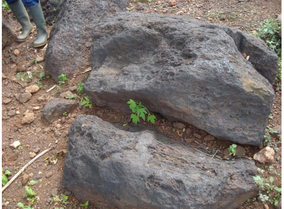
Manganese outcrop at the Konongo Project

1 This exploration target is conceptual in nature and relates to defined exploration targets/areas where mineralisation has been identified but resources have not been delineated. The Exploration Target is based on a strike length of between the mapped extent of 1,500 metres and 1,800 metres, a mineralised thickness of between 50 and 75 metres extending to depths of 50 – 100 metres and an SG of 4.0. The quantity and grade of the exploration target is based on exploration results to date as well as reported grades and thicknesses from manganese mineralisation in similar geological settings within Ghana. There has been insufficient exploration to define a Mineral Resource in these areas and it is uncertain if further exploration will result in the determination of a Mineral Resource.